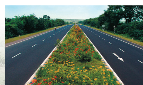
Black Top Roads